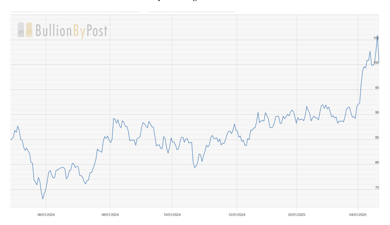
Chart: One-year rolling Gold to Silver Ratio

For most commodities, supply and demand fundamentals dominate price behaviour, however this does not always apply to silver and gold because of their monetary qualities and reactions to macroeconomic factors. Although the price of silver can be strongly linked to gold, silver differs from gold in the fact that it is also considered to be an industrial metal and can also be linked to the performance of base metals production and industrial demand. That said a gold: silver divergence can emerge when the macroeconomic environment deteriorates, however because of its lower liquidity, silver can outperform gold in the event of a financial crisis. The gold to silver ratio as of the date of this MD&A is approximately 1:100 ounces, and ended the year approximately 1:90, with the 12-month rolling high of 1:103 on April 11, 2025 and a low of 1:73 ounces hit on May 29, 2024.