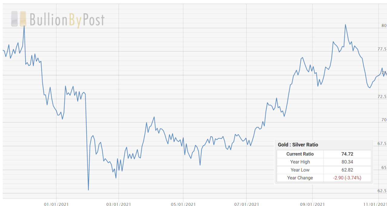
Chart: One-year Gold to Silver Ratio

The strong performance in the silver price has been a welcome contrast for silver investors in comparison to previous years. For most commodities, supply and demand fundamentals dominate price behaviour, however this does not always apply to silver and gold because of their monetary qualities and reactions to macroeconomic factors. Although the price of silver can be strongly linked to gold, silver differs from gold in the fact that it is also considered to be an industrial metal and can also be linked to the performance of base metals production and industrial demand. That said a gold: silver divergence can emerge when the macroeconomic environment deteriorates, however because of its lower liquidity, silver can outperform gold in the event of a financial crisis. The gold to silver ratio as of the date of this MD&A is approximately 1:75 ounces, with the 1-year high of 1:80 and a low of 1:63 ounces.