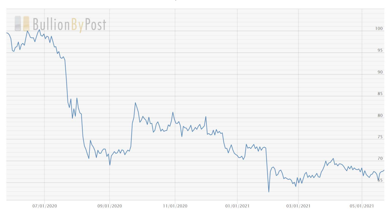
Chart: One year Gold to Silver Ratio

The strong performance in the silver price has been a welcome contrast for silver investors in comparison to previous years. For most commodities, supply and demand fundamentals dominate price behaviour, however this does not always apply to silver and gold because of their monetary qualities and reactions to macroeconomic factors. Although the price of silver can be strongly linked to gold, silver differs from gold in the fact that it is also considered to be an industrial metal and can also be linked to the performance of base metals production and industrial demand. That said a gold: silver divergence can emerge when the macroeconomic environment deteriorates, however because of its lower liquidity, silver can outperform gold in the event of a financial crisis. The gold to silver ratio as of the date of this MD&A is approximately 1:68 ounces, with the 1-year high of 1:100 and a low of 1:63 ounces.